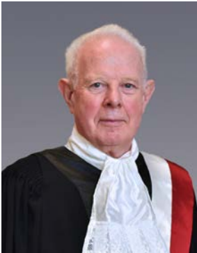
LORD THOMAS OF CWMGIEDD, PRESIDENT

As of 1 January 2019, the judiciary of the Court and Regulatory Tribunal comprise the following: