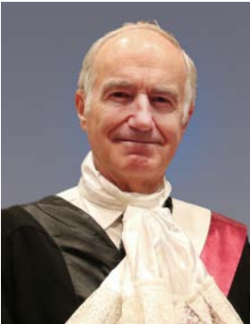
SIR WILLIAM BLAIR