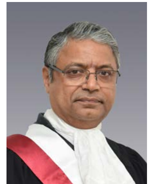
GOPAL SUBRAMANIAM SUPPLEMENTARY JUDGE